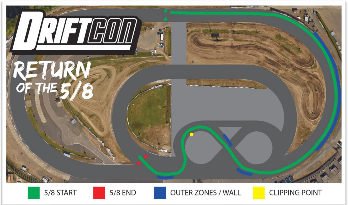
5/8ths "Formula Drift Classic"